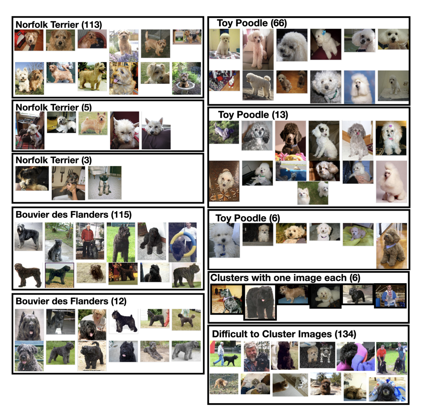
Figure 4: Clusterings obtained by running Algorithm 1 on the Dogs3 dataset from scratch.