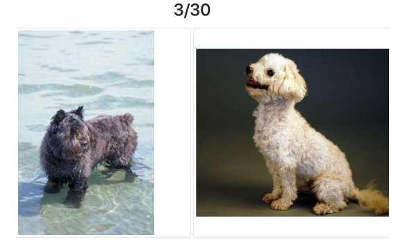
(a) Sample of the pairwise queries displayed to the crowdworkers on Amazon Mechanical Turk (AMT).